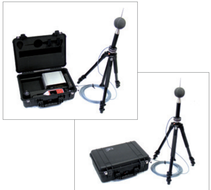
CK:670 Outdoor Kit shown with optional CT:7 Tripod

NoiseTools will display verification symbols if the information matches, a unique feature which will be useful in any legal proceedings.