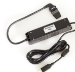
USB communications lead