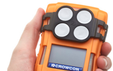
External filter plate Clip-on filter for dusty environments