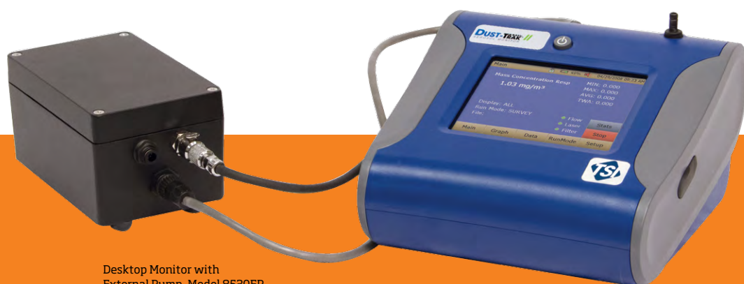
Desktop Monitor with External Pump, Model 8530EP