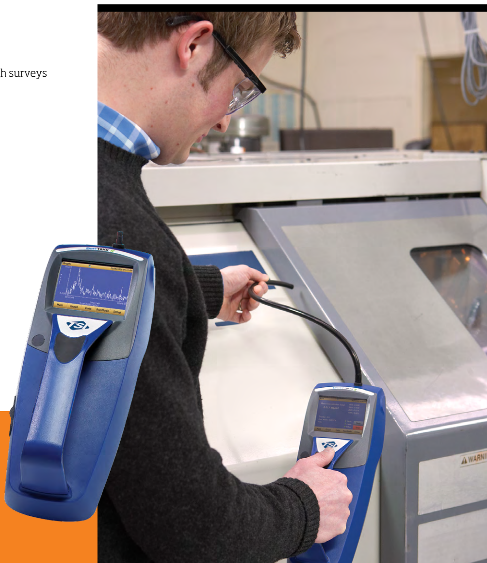
Handheld Monitor, Model 8532

TrakPro™ Data Analysis Software allows you to set up and program directly from a PC. It even features the ability for remote programming and data acquisition from your PC via wireless (922 MHz or 2.4 GHz) communications or over an Ethernet network. As always, you can print graphs, raw data tables, and statistical and comprehensive reports for record keeping purposes.